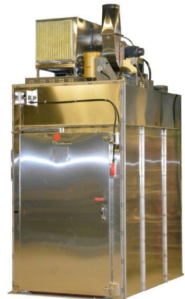
BSL2 sterilization chamber incorporating IHP (Ionized Hydrogen Peroxide) ability

New sterilizers provide control options using a programmable logic controller (PLC) and human machine interface (HMI) based control systems. These controls are simple to use and allow the technician to configure and record the temperature of the